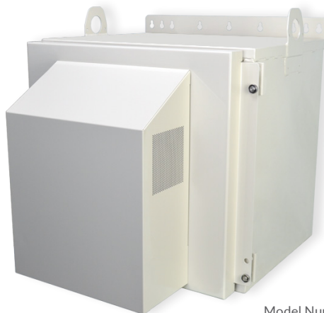
Model Number A90-BXM1019