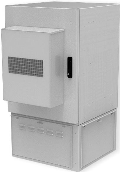
Conjoined Boxer 20 Plus cabinet and optional battery box