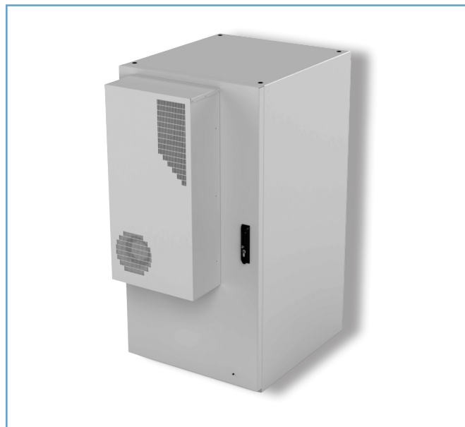
Model Number A90-BXM30P-18HE