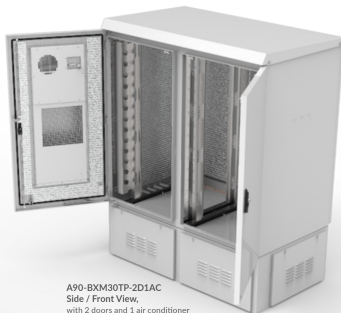
A90-BXM30TP-2D1AC Side / Front View, with 2 doors and 1 air conditioner