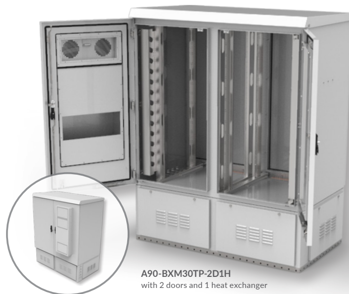
A90-BXM30TP-2D1H with 2 doors and 1 heat exchanger