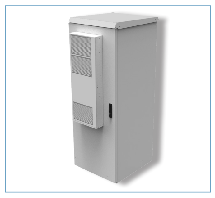
Model Number A90-BXM42P-30HE, with optional solar shield