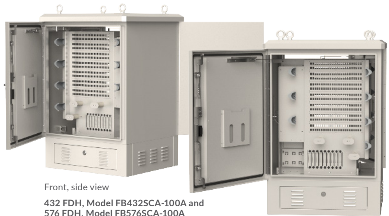
Front, side view