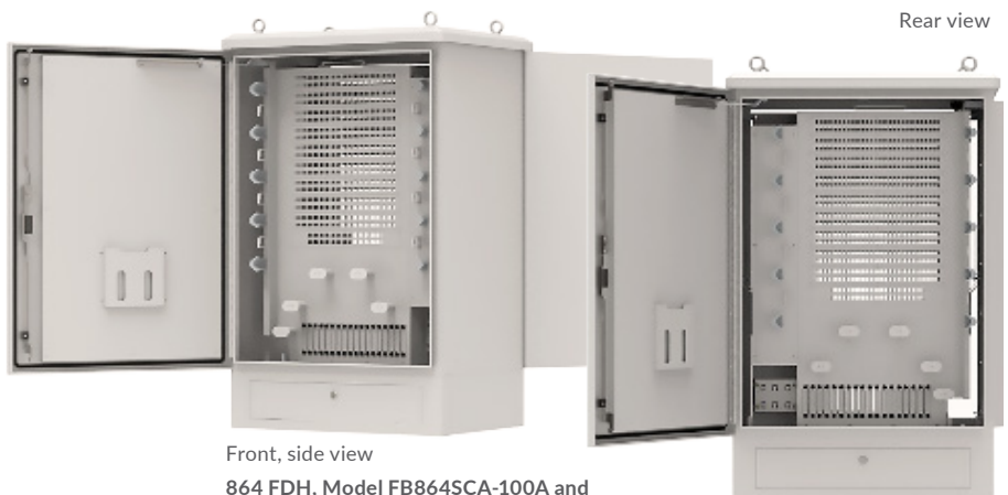
Front, side view