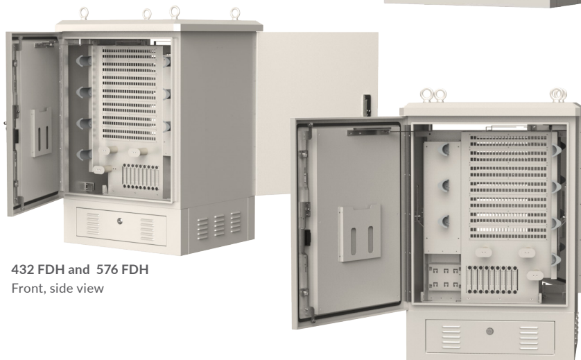
432 FDH and 576 FDH Front, side view