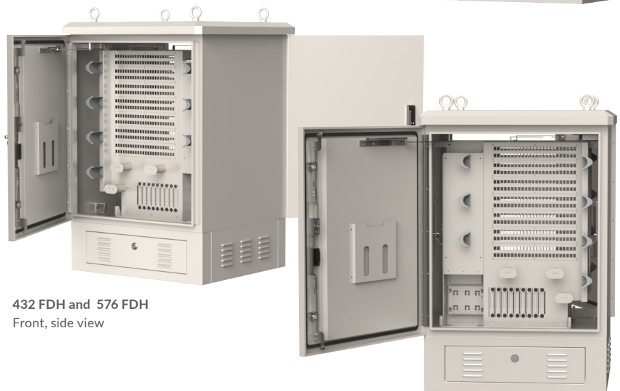
432 FDH and 576 FDH Front, side view