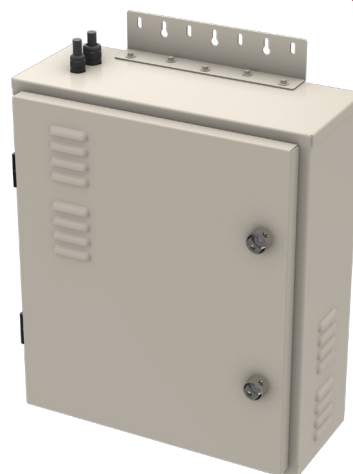
Boxer 5 SL (A90-BXM05SL)