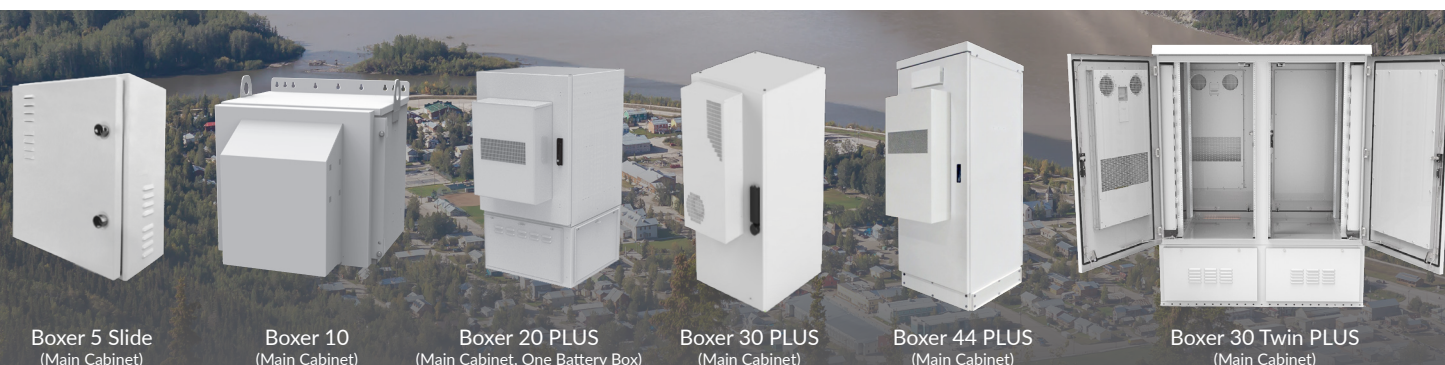
Boxer 5 Slide (Main Cabinet)