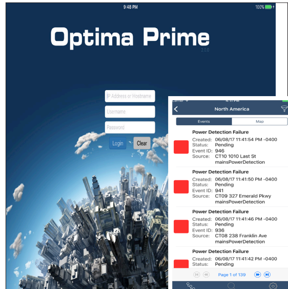
Access the Optima Hosted System over your iPad, above left, or iPhone

Visibility into the network through the Optima Hosted solution, allows all users immediate and convenient access to critical event and performance data from a desktop, laptop or mobile device. All upgrades, general maintenance, and data is collected at the remote location via Westell's Intelligent Site Devices and sent securely to the Optima Hosted System - improving efficiencies and reducing operational expenses by eliminating the need for a dedicated onsite resource to manage and host the Optima software.