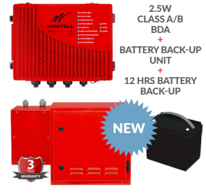
2.5W ProtectLink™ Kit CS40-734834-2524K1