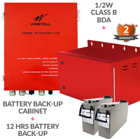
2W eBDA Kit CS14-722-822-K2