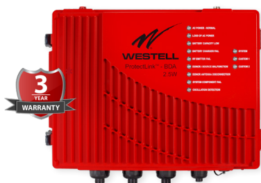
CS45-734-834-A0-K1 / CS45-734-834-A0-K2 (details on page 2)