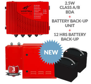
2.5W ProtectLink™ Kit CS40-734834-2524K2